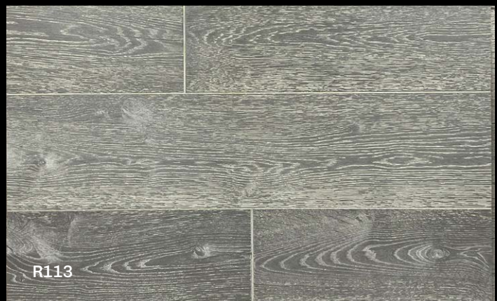
R113 SILVER GREY STAINED OAK, RUSTIC-CD, BRUSHED, UV OILED 20 X 190 X 1900MM WEAR LAYER: 4MM TYPE: T&G 4 BEVEL RRP: £83.95 PER M 2