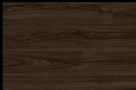
ESCENA LIGHT WALNUT GSPCPLANK5006