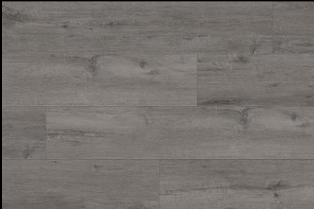
OCEAN DUNES GSPCPLANK2001

PRICE: £39.95 PER M 2 PLANK DIMENSIONS: 6 X 180 X 1200MM INSTALLATION: 5G UNDERLAY 1MM INCLUDED