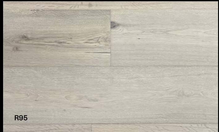
R95 POLAR WHITE STAINED OAK, RUSTIC-CD, BRUSHED, UV OILED 20 X 190 X 1900MM WEAR LAYER: 4MM TYPE: T&G 4 BEVEL RRP: £85.95 PER M 2