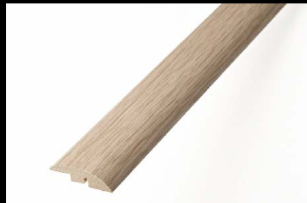
REDUCER 9 X 45 X 1000MM 9 X 45 X 3000MM