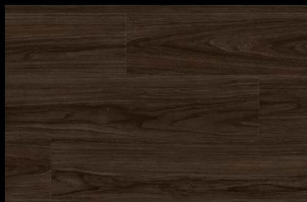
ESCENA LIGHT WALNUT J5119 - 6