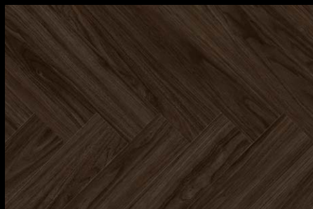
ESCENA LIGHT WALNUT K5119 - 6