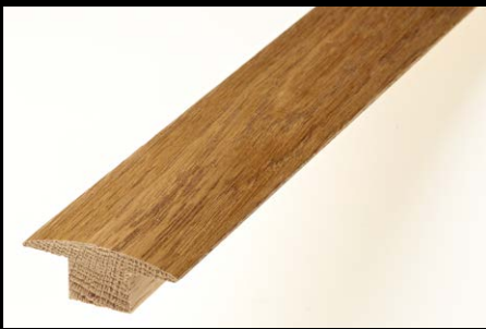
15MM T-PROFILE 21 X 56MM AT