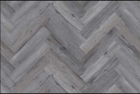
OCEAN DUNES HSPCHB2001

PRICE: £45.95 PER M2 PLANK DIMENSIONS: 6 X 110 X 620MM INSTALLATION: 5G BEVEL: 4 UNDERLAY 1MM INCLUDED