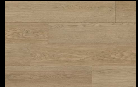
PENINSULA DARK OAK IM6013-1LAML0SW