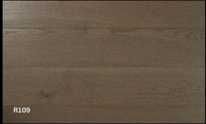
R109 MINK SILVER GREY STAINED OAK, RUSTIC-ABCD, BRUSHED, UV OILED 14 X 190 X 1900MM WEAR LAYER: 3MM TYPE: UNICLIC 4 BEVEL RRP: £74.95 PER M 2