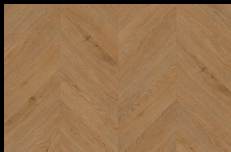
TUCKERS POINT FSPCCHEV2002