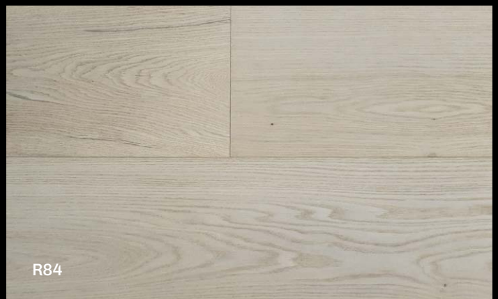
R84 LIMED WASHED OAK, RUSTIC-ABCDE, BRUSHED, UV OILED 18 X 300 X 2200MM WEAR LAYER: 4MM TYPE: T&G 4 BEVEL RRP: £96.95 PER M 2