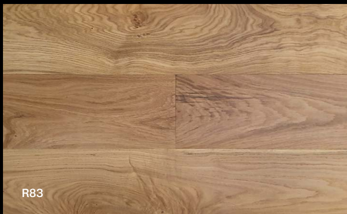
R83 OAK, RUSTIC-ABCDE, BRUSHED, UV OILED 14 X 240 X 1900MM WEAR LAYER: 3MM TYPE: T&G 4 BEVEL RRP: £76.95 PER M 2