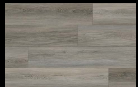
TURTLE POINT IMYC5700LAML0SW