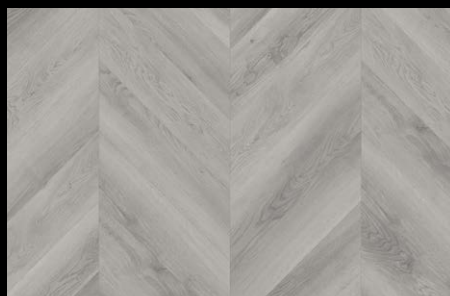
SEA PINES FSPCCHEV2005