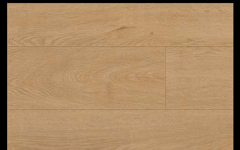
ROCKERY J200432EL - 09