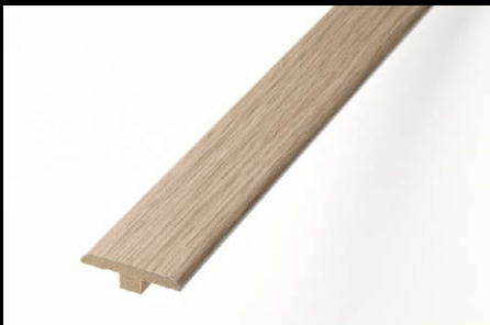
T-PROFILE 9 X 45 X 1000MM 9 X 45 X 3000MM