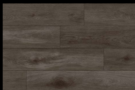
MOON SPA IM6072-5LAML0SW