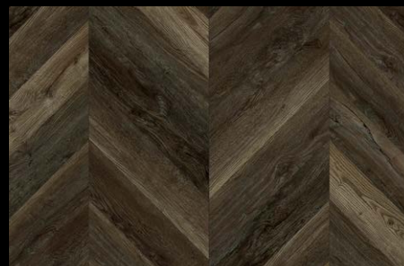
EMERALD BAY FSPCCHEV5007