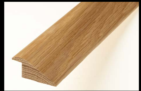
20MM REDUCER 26 X 56MM ARED