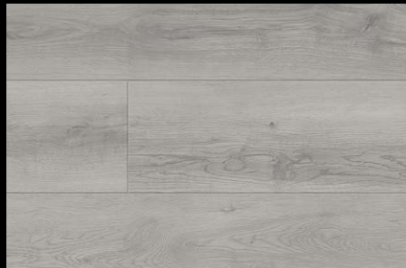
SEA PINES J200410EL - 10