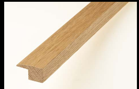
15MM BORDER PROFILE 21 X 36MM AL