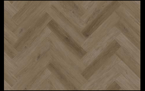
ROYAL CANBERRA HSPCHB2003