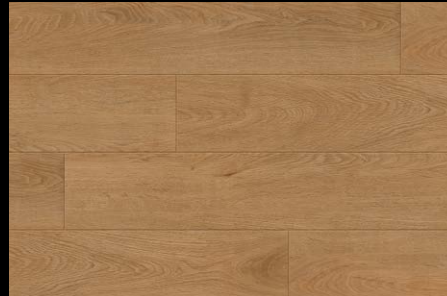
TUCKERS POINT GSPCPLANK2002