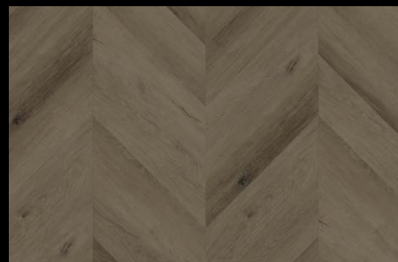
ROYAL CANBERRA FSPCCHEV2003