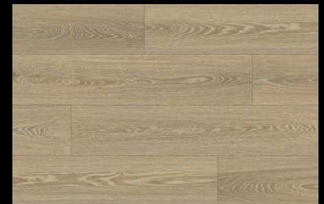
OYSTER REEF OAK IM6026-4LAML0SW