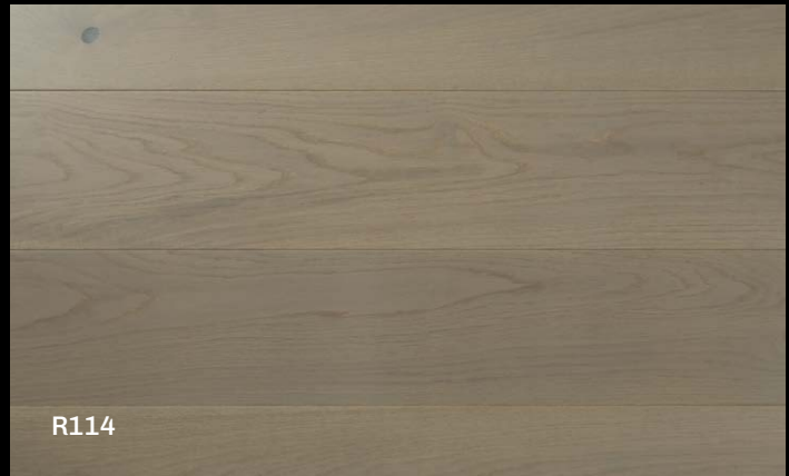
R114 SMOOTH GREY STAINED OAK, RUSTIC-ABCD, UV MATT LACQUERED 14 X 190 X 1900MM WEAR LAYER: 3MM TYPE: UNICLIC 4 BEVEL RRP: £76.95 PER M 2