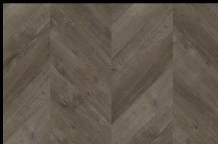
SILVER ROCK FSPCCHEV2010