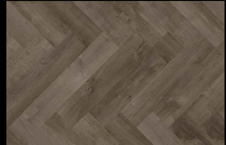
SILVER ROCK K200128EL - 07