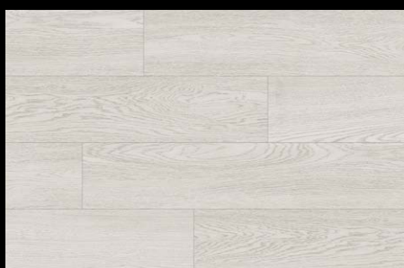
BAY HILL LIGHT GREY IM6071-1LAML0SW