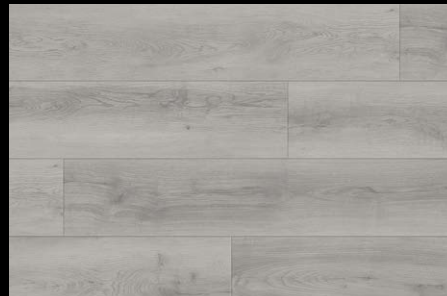
SEA PINES GSPCPLANK2005