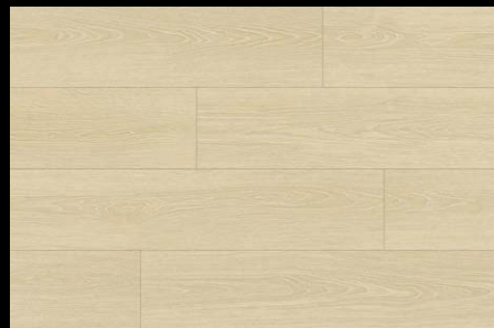
COPPERHEAD OAK IM6024-3LAML0SW