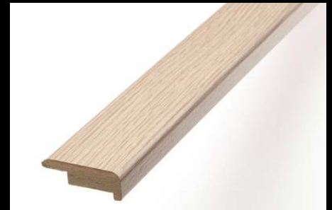
STAIR PROFILE 9 X 50 X 1000MM