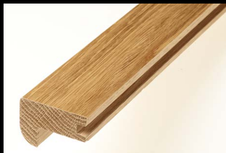
20MM UNIVERSAL STAIR NOSING 54 X 38MM AST-20MM