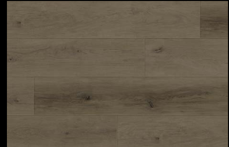
ROYAL CANBERRA GSPCPLANK2003