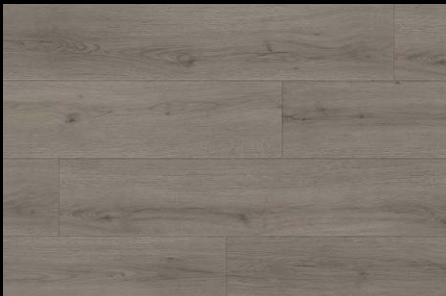
OCEAN RIDGE GSPCPLANK2004