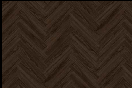
ESCENA LIGHT WALNUT HSPCHB5006