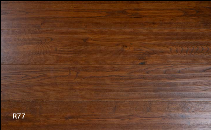
R77 DARK WALNUT STAINED OAK, RUSTIC-CD, BRUSHED, HANDSCRAPED, UV OILED 20 X 190 X 1900MM WEAR LAYER: 4MM TYPE: T&G 4 BEVEL RRP: £91.95 PER M 2