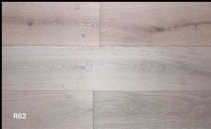
R82 POLAR WHITE STAINED OAK, RUSTIC-ABCD, BRUSHED, UV OILED 14 X 240 X 1900MM WEAR LAYER: 3MM TYPE: T&G 4 BEVEL RRP: £79.95 PER M 2

With glamorous and generous extra wide planks from 240mm to 300mm our Islington boards will change the impression of any room to dramatic effect, making a smaller room appear it has more volume and giving a grand sweep to any larger area. The soft oak finishes will equally compliment both traditional and contemporary settings alike. This product is ideal for laying over underfloor heating and easy to maintain once laid.