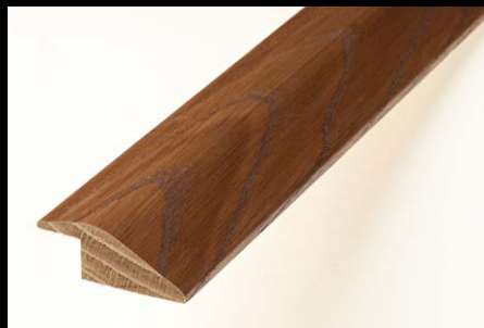
15MM REDUCER 21 X 56MM ARED