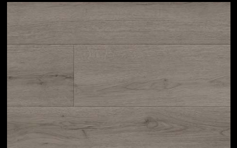
OCEAN RIDGE J200411EL - 13