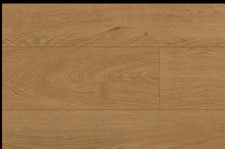
GRAYHAWK J200432EL - 11