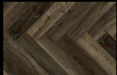
EMERALD BAY K5145 - 6