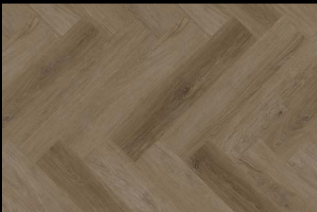
ROYAL CANBERRA K200415EL - 10