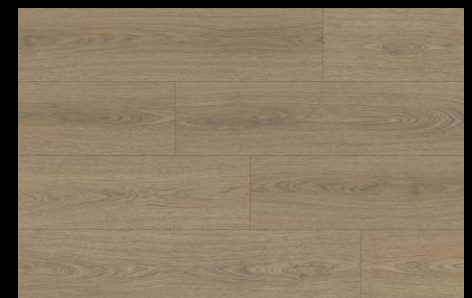
OCEAN FRONT OAK IM6063-9LAML0SW