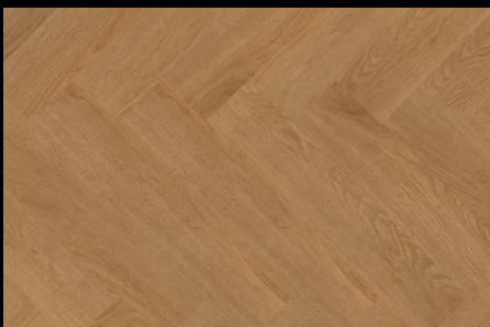
GRAYHAWK K200432EL - 11