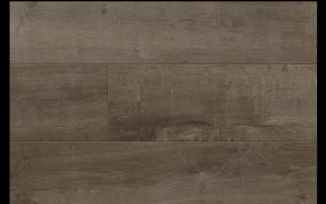
SILVER ROCK J200128EL - 07