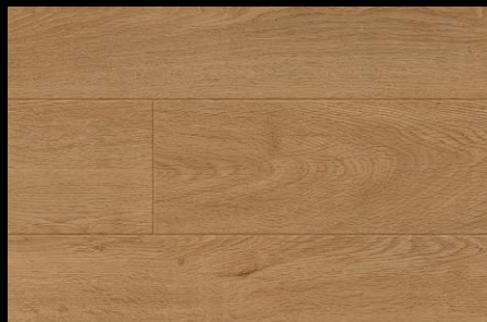
TUCKERS POINT J200432EL - 04