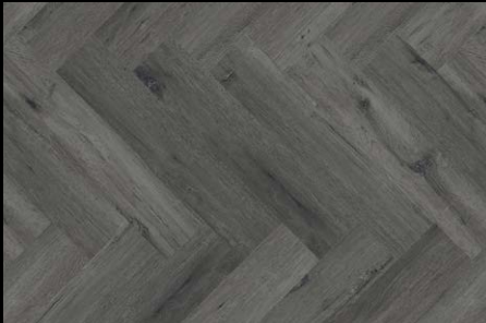
FINCA K200112EL - 06

PRICE: £37.95 PER M 2 PLANK DIMENSIONS: 3 X 122 X 610MM INSTALLATION: GLUE