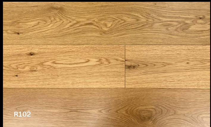
R102 OAK RUSTIC-ABCD LAQUERED 20 X 190 X 1900MM WEAR LAYER: 4MM TYPE: T&G 4 BEVEL RRP: £87.95 PER M 2