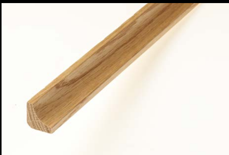
SCOTIA 19 X 19MM ASC

For a seamless, refined finish, we offer an extensive range of expertly crafted mouldings to complement our wooden and laminate floors. Your fitter can provide guidance on selecting the most suitable profiles for a flawless installation.