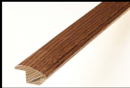
15MM WOOD-CARPET REDUCER 22 X 39MM ACPTRED