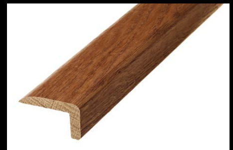
STAIR NOSING MULTI PURPOSE 7 X 28 X 50MM ASTMULTI