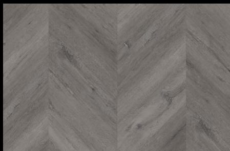
OCEAN DUNES FSPCCHEV2001

PRICE: £45.95 PER M 2 PLANK DIMENSIONS: 6 X 127 X 600MM INSTALLATION: 5Gi UNDERLAY 1MM INCLUDED