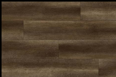
PINE HILLS OAK IM6021-4LAML0SW