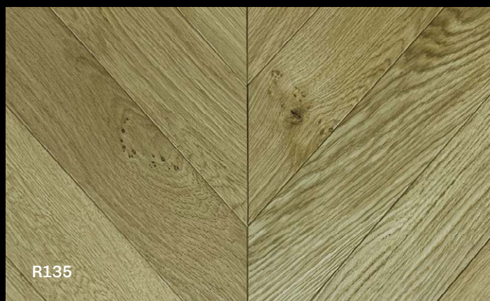
R135 NATURAL OAK, RUSTIC-ABCD, BRUSHED, UV OILED 14 X 90 X 540MM WEAR LAYER: 3MM TYPE: T&G 4 BEVEL RRP: £85.95 PER M 2