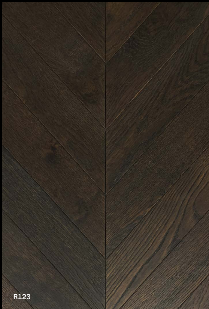
R123 DARK MOCHA STAINED OAK, RUSTIC-ABCD, BRUSHED, UV OILED 14 X 90 X 540MM WEAR LAYER: 3MM TYPE: T&G 4 BEVEL RRP: £85.95 PER M 2