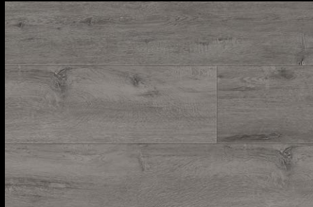
OCEAN DUNES J200112EL - 09