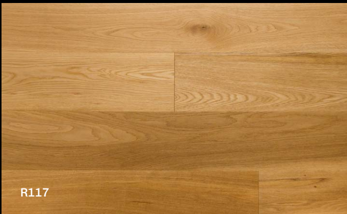
R117 OAK, RUSTIC-ABCD, BRUSHED, UV OILED 14 X 190 X 1900MM WEAR LAYER: 3MM TYPE: UNICLIC 4 BEVEL RRP: £74.95 PER M 2