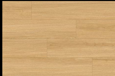
RENAISSANCE OAK IM6008-1LAML0SW