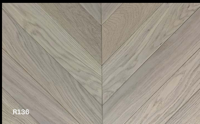
R136 PEARL WHITE STAINED OAK, RUSTIC-ABCD, BRUSHED, UV OILED 14 X 90 X 540MM WEAR LAYER: 3MM TYPE: T&G 4 BEVEL RRP: £85.95 PER M 2