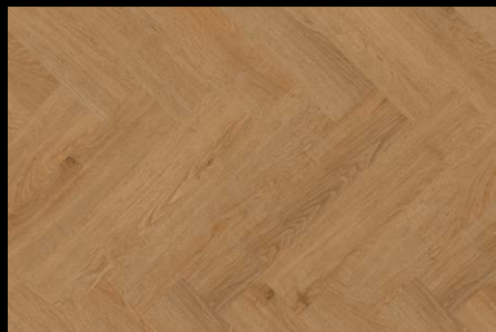
TUCKERS POINT K200432EL - 04