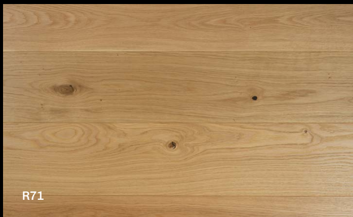
R71 OAK, RUSTIC-CD, BRUSHED, UV OILED 20 X 190 X 1900MM WEAR LAYER: 4MM TYPE: T&G 4 BEVEL RRP: £83.95 PER M 2