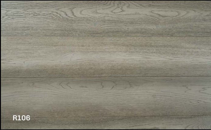
R106 SILVER GREY WASHED OAK, RUSTIC-ABCD, BRUSHED, UV LACQUERED 14 X 190 X 1900MM WEAR LAYER: 3MM TYPE: UNICLIC 4 BEVEL RRP: £78.95 PER M 2