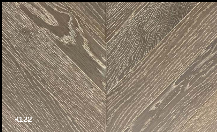
R122 WHITE WASH COFFEE STAINED OAK, RUSTIC-ABCD, BRUSHED, UV OILED 14 X 90 X 540MM WEAR LAYER: 3MM TYPE: T&G 4 BEVEL RRP: £85.95 PER M 2

This stunning range of oak flooring entwines a traditional feature of Chevron with a contemporary size board, the micro bevel on each plank defines the pattern you create. The earthy shades in Soho will enhance any room in your house or business, and the oiled finish makes this an easy floor to maintain.