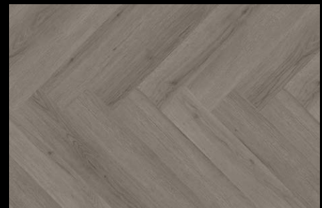
OCEAN RIDGE K200411EL - 13