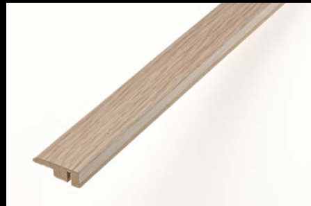
BORDER PROFILE 9 X 32 X 3000MM