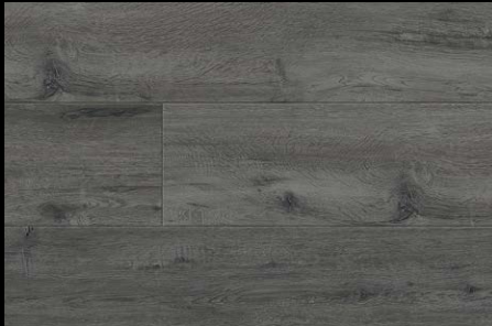
FINCA J200112EL - 06

PRICE: £35.95 PER M 2 PLANK DIMENSIONS: 3 X 180 X 1200MM INSTALLATION: GLUE