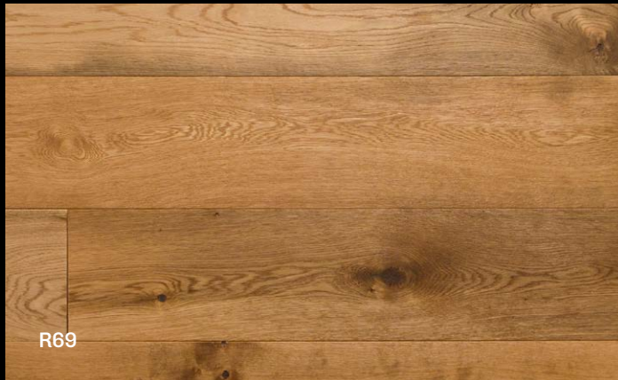
R69 OAK, RUSTIC-CD, SMOKED, BRUSHED, UV OILED 20 X 190 X 1900MM WEAR LAYER: 4MM TYPE: T&G 4 BEVEL RRP: £87.95 PER M 2

This unique 20mm multi-layer rustic floor celebrates the natural characteristics of European oak. This product can be used as a structural board allowing it to be laid across floor joists. It can also be laid as a floating floor or directly adhered to the substrate. It can also be used over underfloor heating. An easy option for care and maintenance.