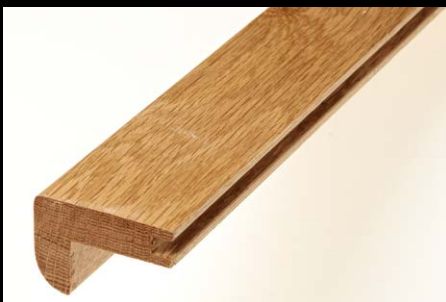
15MM UNIVERSAL STAIR NOSING 54 X 38MM AST-U