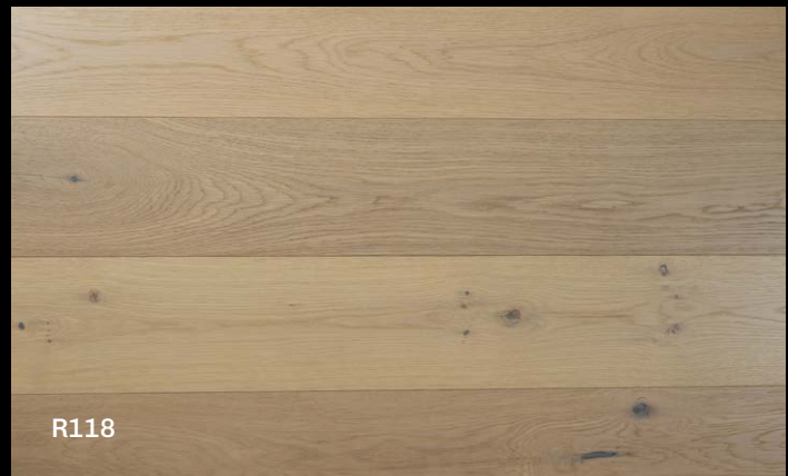
R118 EARTH NATURAL STAINED OAK, RUSTIC-ABCD, BRUSHED, UV OILED 14 X 190 X 1900MM WEAR LAYER: 3MM TYPE: UNICLIC 4 BEVEL RRP: £76.95 PER M 2