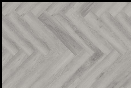
SEA PINES K200410EL - 10