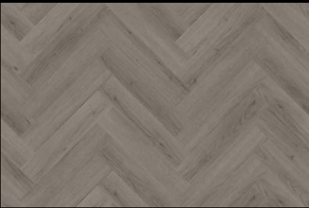
OCEAN RIDGE HSPCHB2004