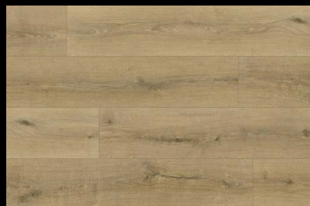
WEST PALM OAK IM6037-2LAML0SW