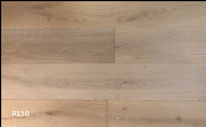
R110 POLAR WHITE STAINED OAK, RUSTIC-ABCD, BRUSHED, UV OILED 14 X 190 X 1900MM WEAR LAYER: 3MM TYPE: UNICLIC 4 BEVEL RRP: £76.95 PER M 2