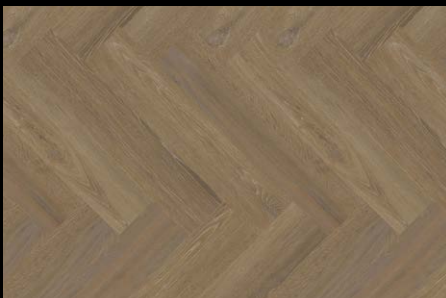
HERITAGE K200403EL - 13