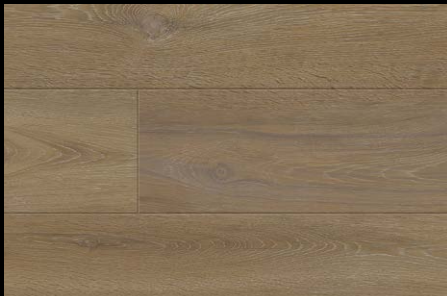
HERITAGE J200403EL - 13