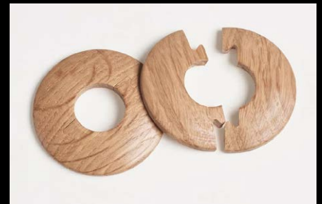
WOOD PIPE COVERS

LOW LINE 15MM UNP OAK, WALNUT, SMOKED, WHITE, GREY, DARK GREY