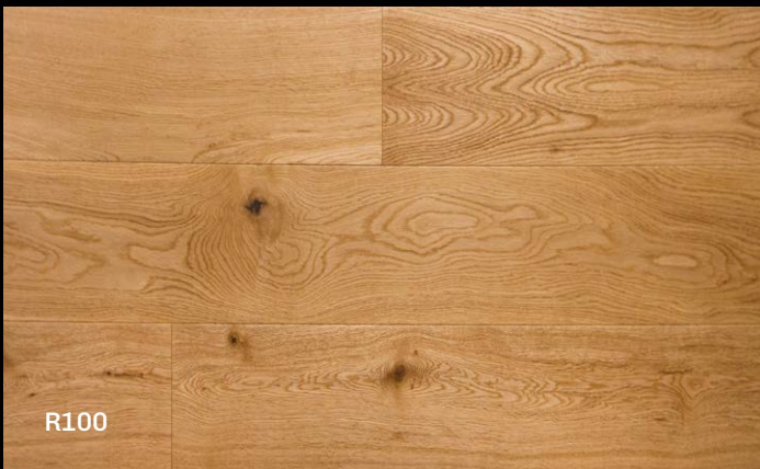
R100 OAK, RUSTIC-CD, BRUSHED, HANDSCRAPED UV OILED 20 X 190 X 1900MM WEAR LAYER: 4MM TYPE: T&G 4 BEVEL RRP: £89.95 PER M 2