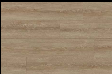
BOULDERS OAK IM6033-3LAML0SW