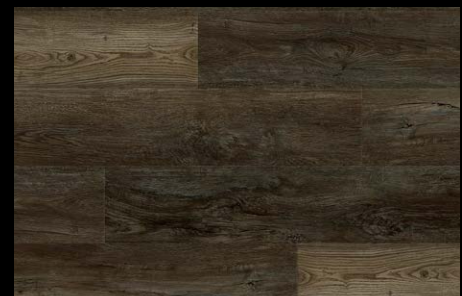
EMERALD BAY GSPCPLANK5007