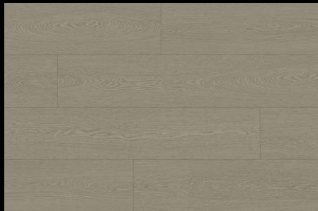
SOUTH CREEK OAK IM6007-1LAML0SW

PRICE: £31.95 PER M 2 PLANK DIMENSIONS: 10 X 196 X 1200MM INSTALLATION: 5G