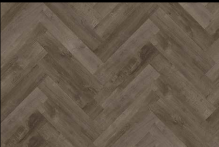
SILVER ROCK HSPCHB2010