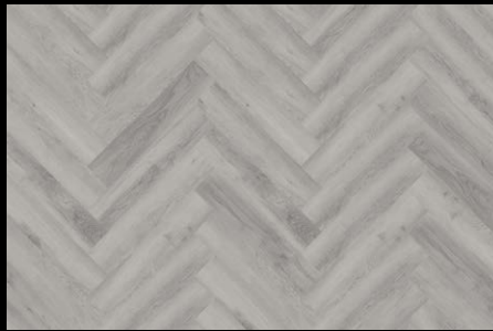
SEA PINES HSPCHB2005