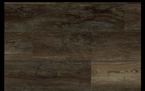
EMERALD BAY J5145 - 6