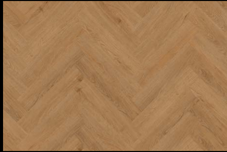
TUCKERS POINT HSPCHB2002