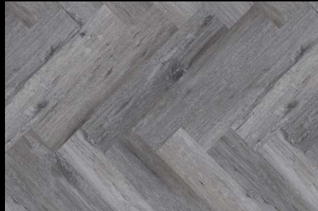
OCEAN DUNES K200112EL - 09