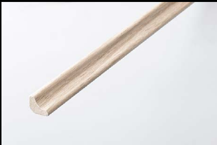
SCOTIA 19 X 19 X 2400MM