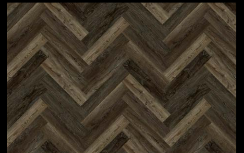
EMERALD BAY HSPCHB5007