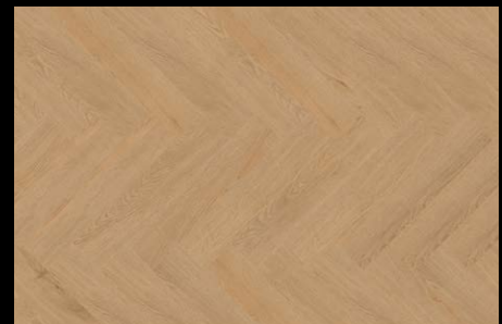
ROCKERY K200432EL - 09