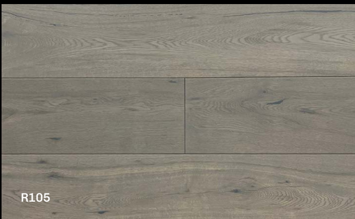
R105 SMOOTH GREY STAINED OAK, RUSTIC-CD, UV MATT LACQUERED 20 X 190 X 1900MM WEAR LAYER: 4MM TYPE: T&G 4 BEVEL RRP: £59.95 PER M 2