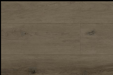
ROYAL CANBERRA J200415EL - 10