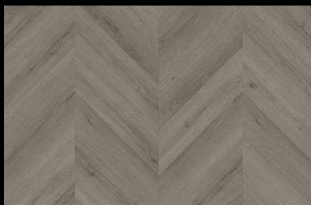
OCEAN RIDGE FSPCCHEV2004