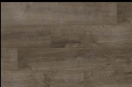
SILVER ROCK GSPCPLANK2010