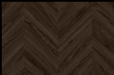
ESCENA LIGHT WALNUT FSPCCHEV5006